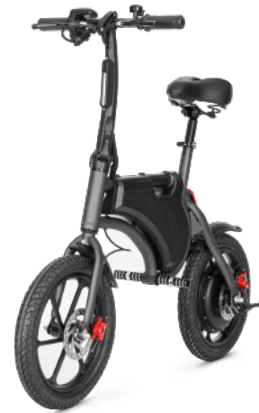
LMTDF-13L Balance bike