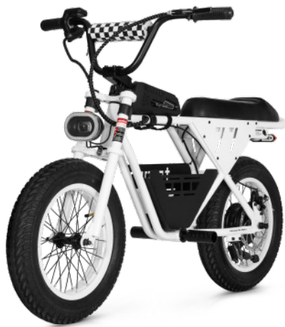
LMTDF-77L Balance bike